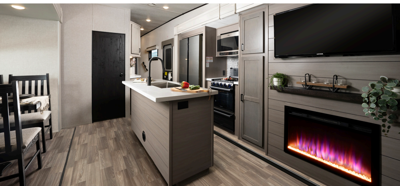
2024 GSL FW 354MBH